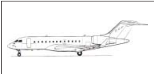
DMC1319 for the Bombardier BD-700 Global Express

FOR ELECTRICAL CONNECTORS AND WIRING SYSTEMS