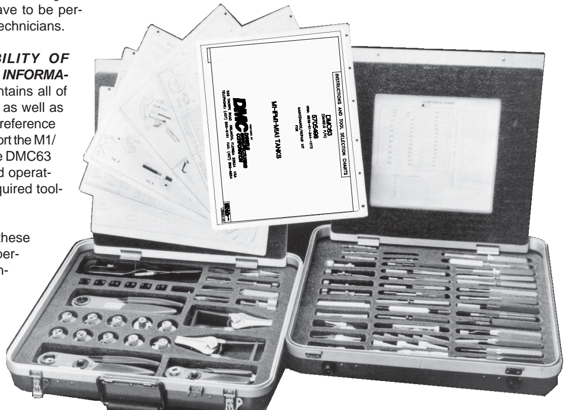
Actual Kit may vary from example shown.

ALL IN ONE. Since all of these tools, together with their operating instructions, are contained in a single kit, the connector repair can be made in the shortest time possible, thus permitting a rapid return of your M1/M1A1 MBT to service.