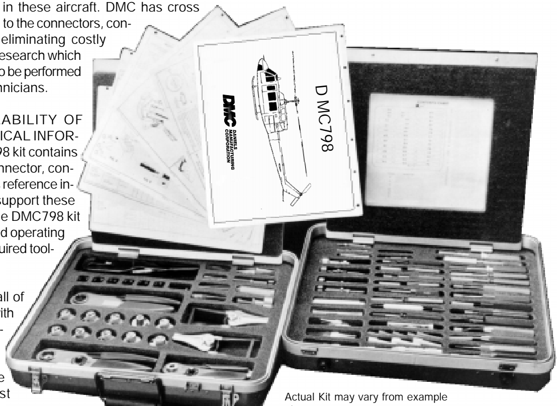
Actual Kit may vary from example shown.

ALL IN ONE. Since all of these tools, together with their operating instructions, are contained in a single kit, the connector repair can be made in the shortest time possible, thus permitting a rapid return of your BELL 222 and the SIKORSKY S-76 to service.