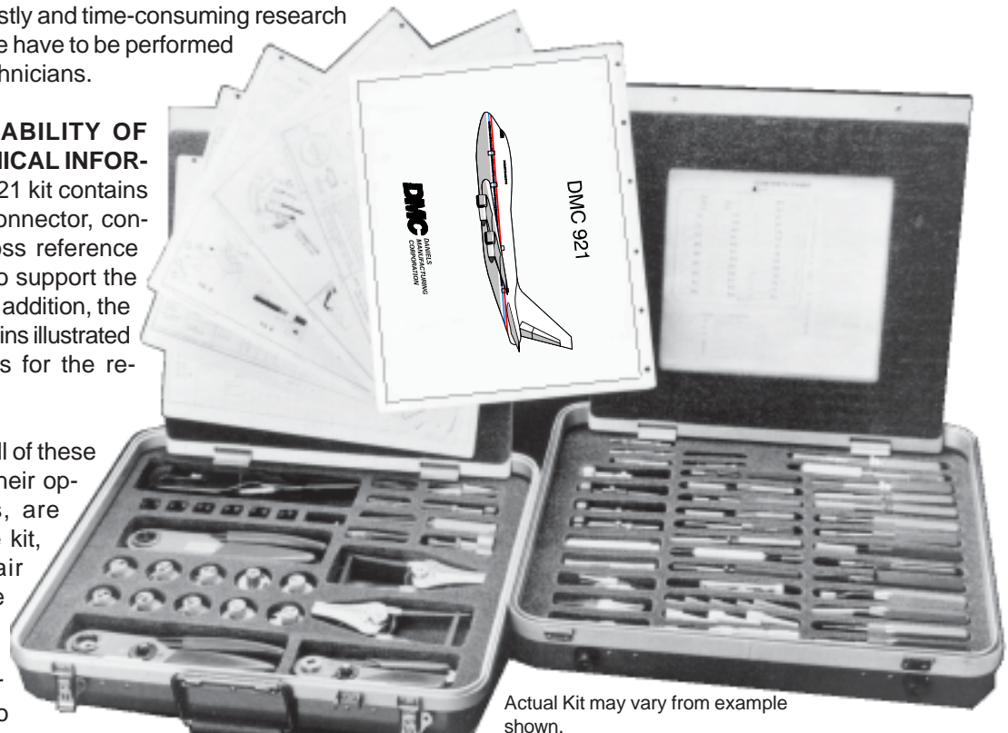
Actual Kit may vary from example shown.

ALL IN ONE. Since all of these tools, together with their operating instructions, are contained in a single kit, the connector repair can be made in the shortest time possible, thus permitting a rapid return of your Boeing 747 Series to service.